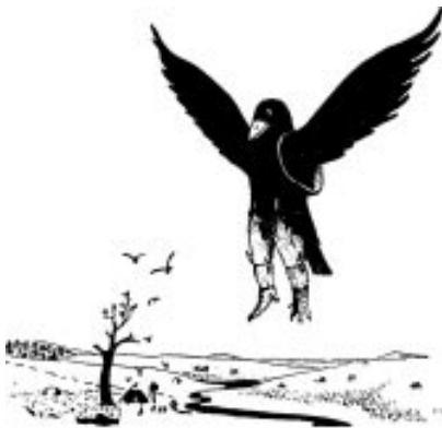
Figure 5. The raven son-in-law. A drawing by V. Charnoluski.

The second subgroup mainly focuses on the following details: The raven married the old man's (and his wife's) oldest daughter, the seal married the middle one, and the reindeer married the youngest daughter. The old man and his wife went to visit their daughters and saw that the only daughter living happily was the one married to the reindeer. The only similarity between the second and the first subgroup of stories is that it is the youngest daughter of the old man (or the mortal Sami man) and his wife who is married to a reindeer.