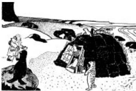
Figure 6. The seal son-in-law. A drawing by V. Charnoluski.