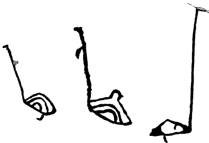
Figure 4. The long-necked swan petroglyphs referring to the magic related to neck. The Neolithic site of rock-carvings at Cape Peri Nos, Lake Onega.

Thus, the mythical house of a reindeer was, in fact, a reindeer. The idea clearly refers to the microcosmic concepts and skeleton-related customs of the Sami. The