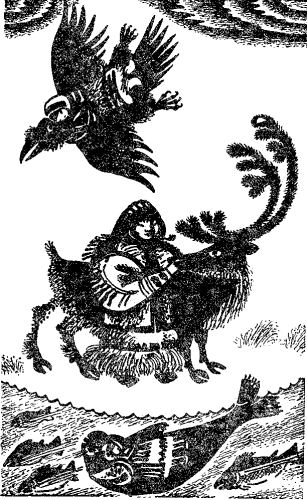
Figure 7. Three suitors . An illustration by V. Petrov, after Sangi 1985. The artist has had a vision of a three-sphere universe.

The eighth story is already familiar in its contents (see also the seventeenth story). V. Charnoluski has recorded two stories with the same title: one from Aahkkel and the other from Turia (cf. the 13th story). The Aahkkel version is very characteristic to the Meandash's marriage of the second subgroup, although the proposal motif is rather brief.