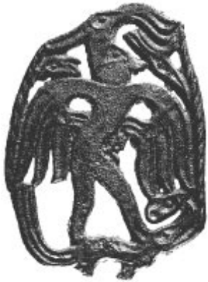
Figure 1. The Meandash-stories have been used in interpreting the contents of the Perm animal-style brass fillets. A human reindeer with wings on a saurian creature. 7th–8th century. After Oborin & Chagin 1988.

pher Nikolai Haruzin has also taken interest in this tale, though to a smaller extent (Haruzin 1890).