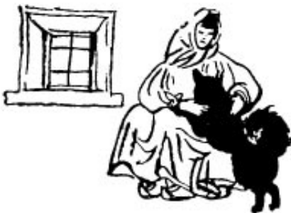
Figure 10. A lovely dog. Illustration by N. Kostrov, after V. Charnoluski 1962.

The second exogamous group in the current story was formed by the descendants of the reindeer, including both the mother-in-law as well as the daughter-in-law, as both of them started to give birth to reindeer children. The mother's warnings also refer to the reindeer who snares dogs with reindeer traps. Similar stories can emerge only among a mixed group of people who consider both dog