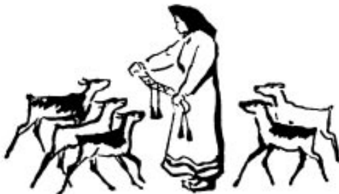
Figure 8. Tying ribbons around the reindeer calves' necks. An illustration by N. Kostrov after V. Charnoluski 1962.

The proposal scene is soon followed by a visit by the old man and his wife. Life in Meandash world as well as in human world was thought to be regular. In the morning they got up, the husband went hunting, then they ate dinner and went to sleep. The passage of time is constantly emphasised (e.g. "life went on.."). Grandmother had a kind and warm attitude towards her grandchildren – it is shown by her making red collars for them. These are semantically comparable to the red baize ribbons mentioned in the first story (see above), which were tied around the ears of reindeer calves.