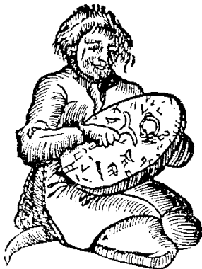
Figure 3. A Sami witch saying charms. After J. Schefferus (1674).

The Meandash-maiden as a young woman and the mother of Meandash, appears in this version only. Other tales speak of an old wise and experienced woman (which in ancient Finno-Ugric tradition suggests a witch). According to the narrator, Meandash-nijt lives in human form, and only becomes a reindeer-cow upon the crossing the river of blood. She has settled in Meandash land with her children, who include the eldest son, whom she has said: “You are meandash – the reindeer,” as well as her nameless younger children (reindeer calves). No father is mentioned however. The son did not feed on grass and lichen, as a reindeer would, but instead went hunting, i.e. followed the traditional life style of the ancient Sami.