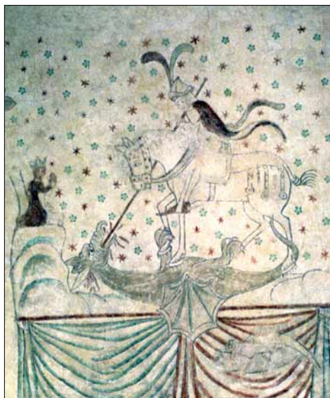
Photo 1. St. George and the Dragon. Fragment from a fresco in Öja church on Gotland, Sweden.

fighting the dragon as it occurs in its so-called pure plot, AT 300 “The Dragon-Slayer”. This is a heroic fight, not for instance stealing back the king’s daughter from a sleeping dragon as it happens in the fairy tale type AT 653 (a well-known story “The Four Skilful Brothers” ( Die vier kunstreichen Brüder ) by the Brothers Grimm – KHM 129).