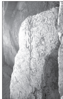
Figure 3. The World Tree from a Karelian rock carving.

The northern Finno-Ugric peoples know a myth about a hunt for the Sun Elk, with the Big Dipper or Ursa Major related to the elk and the Northern Star with the hunter in various interpretations. The Zalavruga rock art location in North Karelia features a group of hunting scenes that bears a resemblance to the starry sky. Let us attempt to follow this celestial hunt. The above picture holds the whole story of the hunt. The hunter ( Perseus – 1) skis until he sees the first elk ( Auriga – 2). His ski track is the Milky Way. The Milky Way is the sparsest in the Perseus – Auriga region – the tracks end at Perseus. Next the hunter ( Vega – 3) chases the elk (mainly Hercules – 4), in the end he (the North Star, the skis are the back wheels of Ursa Minor – 5) secures the elk ( Ursa Major – 6) with a lasso. The photo also shows lighter patches where the Pleiades and Taurus would be on the star chart.