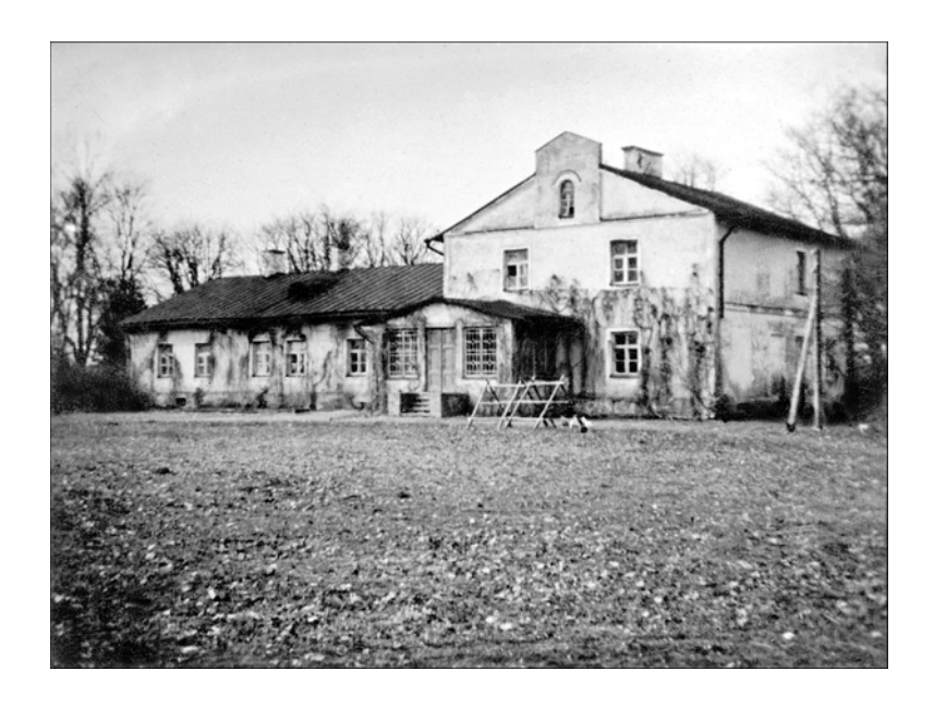
Figure 1. Main building of the Uue-Varudi manor.

down until the present day and culminated in 2004 with the collapse of the burial chamber of F. J. T. von Adlerberg at the exact same time that a new and restored grave stone was placed on the resting place of the Hasselblatts.