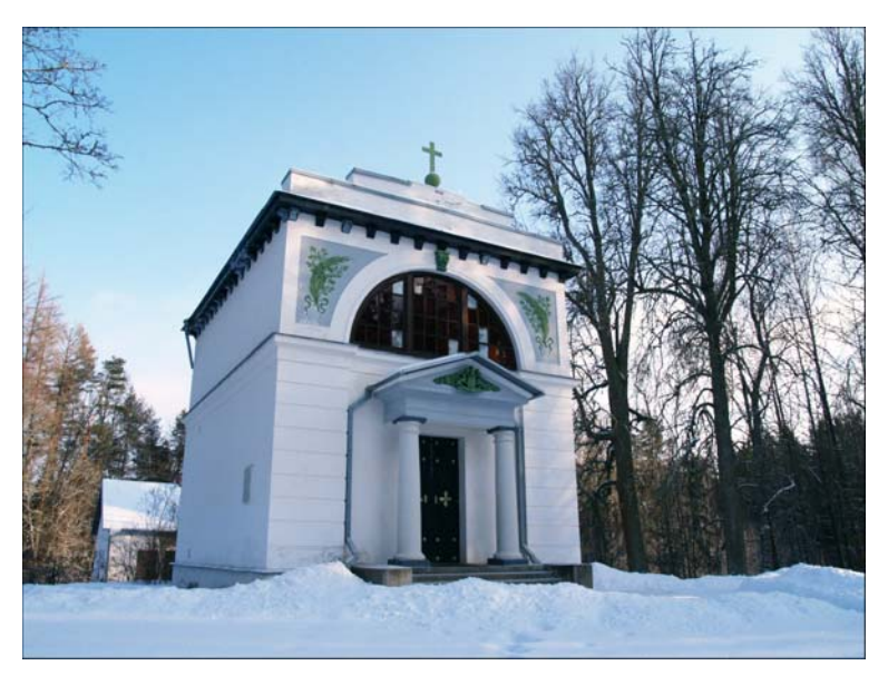
Figure 2. The mausoleum for Barclay de Tolly completed in 1823 in Jõgeveste.

Although both the chapel of Barclay de Tolly in Jõgeveste and the chapel of Wassermanns in Hargla represent the tradition of south Estonia, it does not play an important role whereas all the buried belong to the nobility and are thus independent of local traditions. Also the subterranean chamber in Viru-Nigula should not hamper the comparison with the chapel burials, since in case of the chapels the coffins have been placed in the basements under the chapel