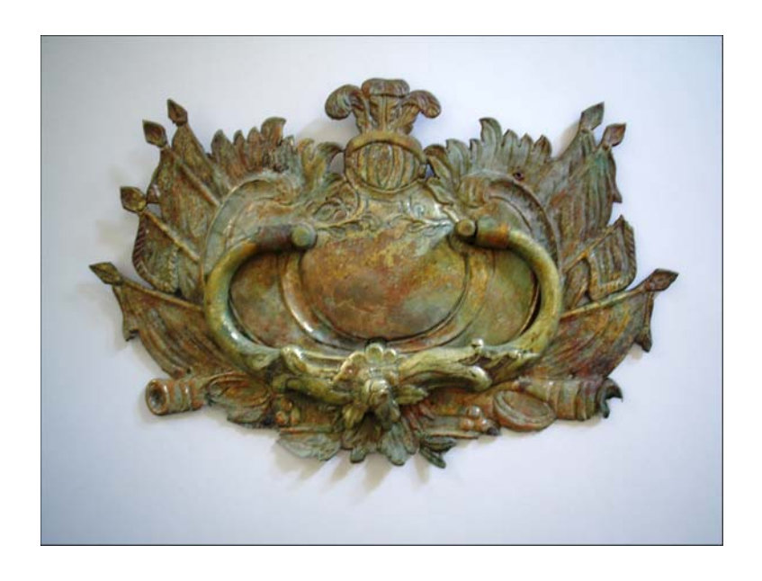
Figure 6. The handle of the coffin of F. J. T. von Adlerberg.