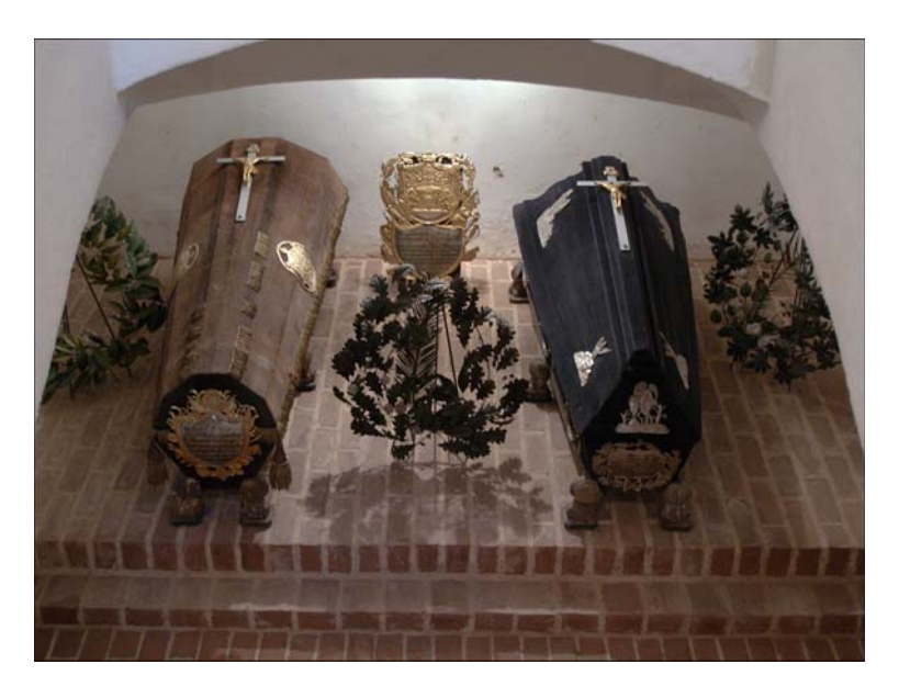
Figure 3. The coffins of Michael Andreas Barclay de Tolly and Helene Auguste Eleonore von Smitten in Jõgeveste in the mausoleum cellar of de Tolly.

floor as well (Figure 2). Richly decorated coffins both in rural and town cemeteries are typical of the burials of the nobility during the observed period. In town and rural graveyards of the period primarily only few nails have been preserved of the coffins. In some cases few objects connected with the clothing can be found in the cemeteries, for example belt buckles, whereas coins related to the deceased, so typical of earlier burials, are completely missing. The burials of the nobility include coffin handles with decoration plates, usually brocade bands; other discovered ornamentation includes tufts and fringes. However, except for the coffin handles there are no "obligatory" decoration elements of the coffin. The rest probably depended on the wealth and aesthetic taste of the relatives of a particular deceased person. Thus there might be a crucifix attached to the coffin cover (Peets & Peets 2002; Peets 2002) but this is not a mandatory element (Figure 3). Unfortunately there are no written sources concerning grave goods placed into the coffin to accompany the dead, the artefactual material is usually lacking as well. The latter circumstance, however, might not reveal the adequate situa-