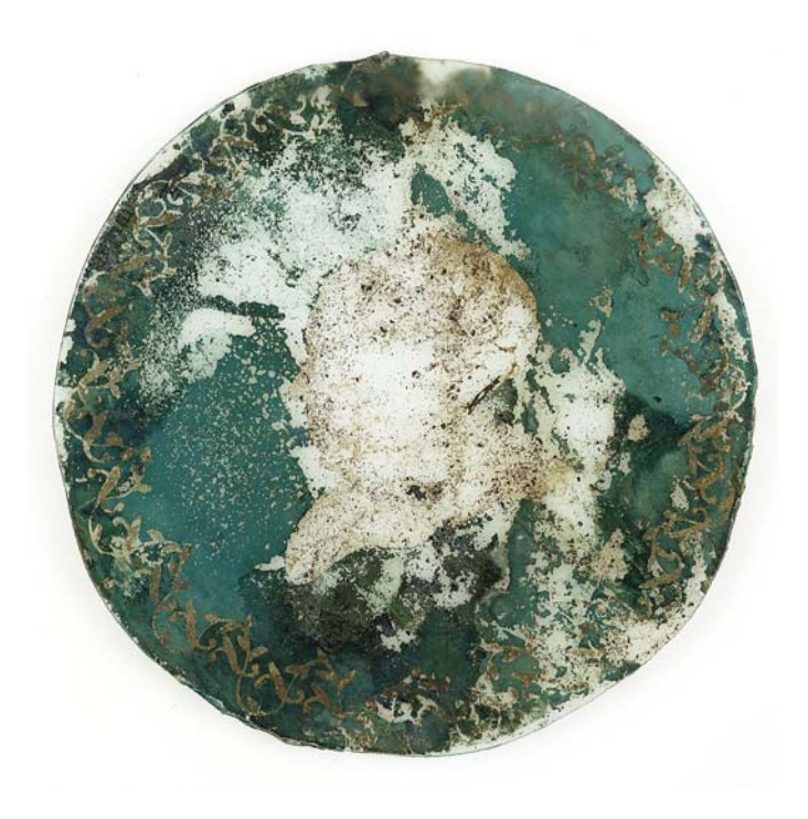
Figure 10. The painted glass from the tomb of F. J. T. von Adlerberg.

edly depicting a man. In comparison with the possible depiction of F. J. T. von Adlerberg, some similarities could be detected, although as a whole the painting is still different and it is unlikely that they represent the same person.