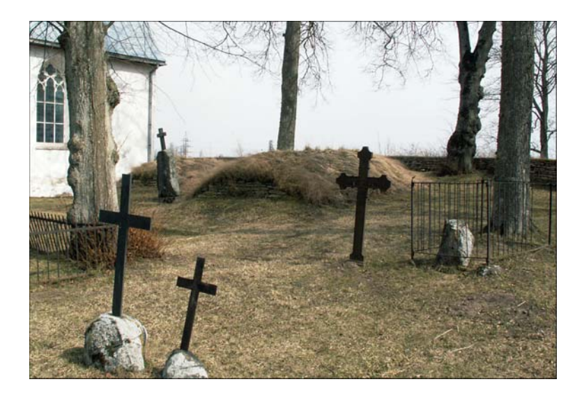
Figure 12. Two burial chambers with onground vault laid of limestone in the Lüganuse churchyard where Jaan Jung discovered mummies at the end of the 19th century: "There was a woman with white face and deep white coif inside one coffin, so intact that had she been familiar, she would have been recognized at once" (Jung 1910: 142).

the chamber were detected, it was supposed that the chamber had been built earlier (in the 18th century?) and had been used for burying already then. After that the vault had collapsed for some reason and the chamber was emptied from the earlier burials (the skull and the sacrum in the southwestern corner might have been left behind). The deceased woman was then placed into the chamber and twenty years later the man. Finally a low-arched cylinder vault was laid below the walls of the chamber. It was considered possible that while the western wall of the chamber has been separated from the other walls by a joint, the initial entrance may have situated there and was bricked in later. This type of burial chambers with an onground vault and which upper part of the whole western wall has been open are known elsewhere. A fine example is the Lüganuse churchyard where Jaan Jung has discovered mummified bodies in a burial chamber (Figure 12) (Jung 1910: 141–142). Similar burial chambers which have a narrowing upper part of the open wall are