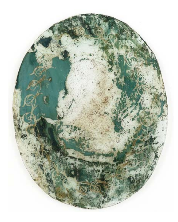
Figure 11. The painted glass of the southernmost set from the tomb of F. J. T. von Adlerberg.

of paper were preserved on the back of the plate. The paper originated from some printed material but the letter K and the number 40 that could only be discerned on the paper do not enable to determine the source more specifically.