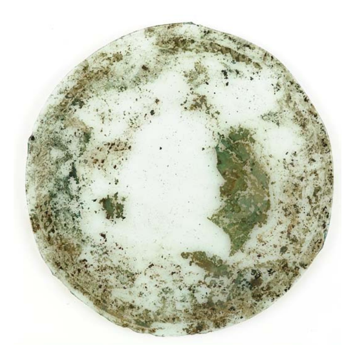
Figure 9. The painted glass from the tomb of F. J. T. von Adlerberg.

plates had unevenly cut edges and the glass with a painting had a relatively well preserved surrounding meandric ornament. Unfortunately the silhouette had been so badly preserved that it could hardly be discerned.