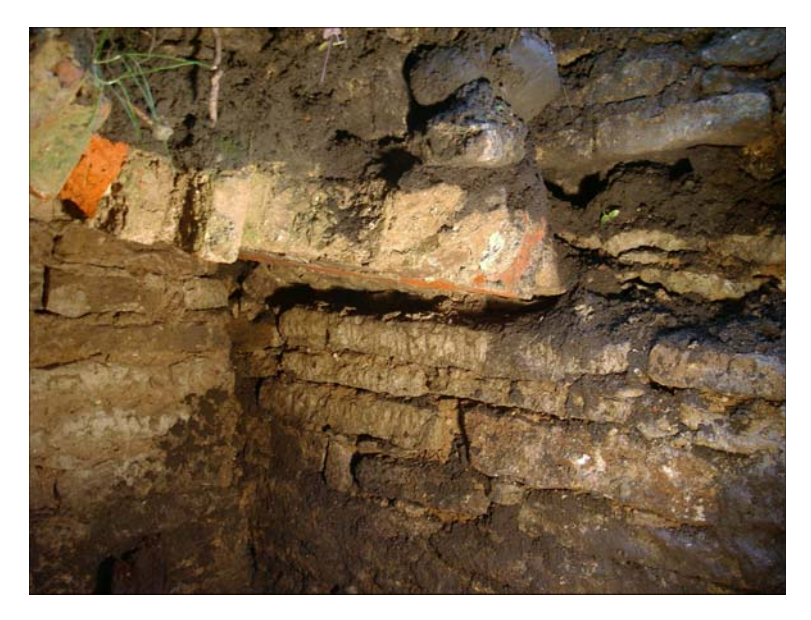
Figure 13. The cylinder vault of the burial chamber of the von Adlerbergs. The vault has been supported by the incised grooves in the long walls of the chamber and covered with soil.

known from the churchyard of Väike-Maarja and one from the Viru-Nigula churchyard as well.