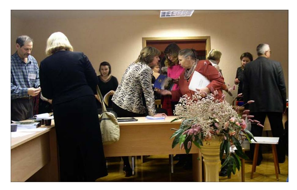
Photo 1. Visitors of the congress at the registration. February 2006.

Most of the speakers in this session had arrived at their topic by relying on their personal fieldwork experience or having read theoretical studies on fieldwork.