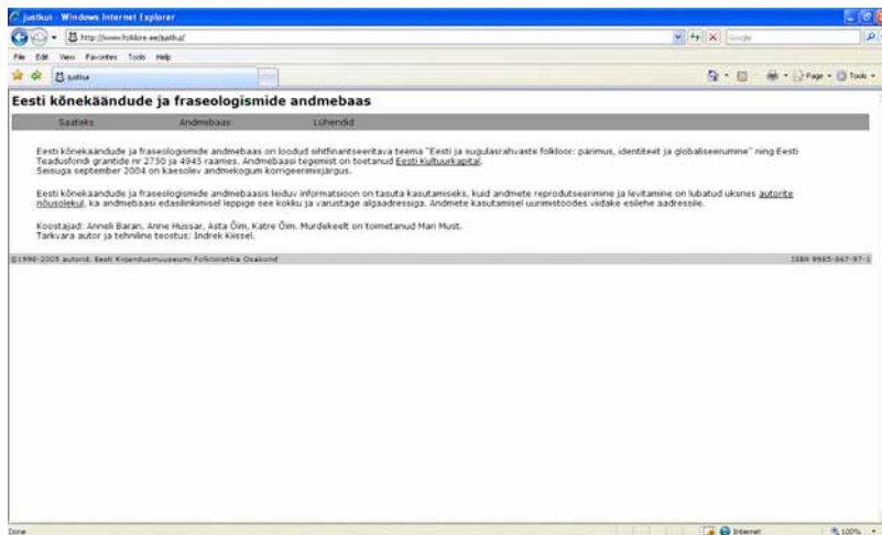
Figure 1. A view of the database of Estonian Phrases – the opening page.

My article is based on the source material from the database of Estonian Phrases, or Eesti kõnekäänud ja fraseologismid – available at http://www.folklore.ee/justkui , which is compiled by the work group of short forms of the Department of Folkloristics at the Estonian Literary Museum in the framework of the state financed topic Estonian and Kinsfolk Folklore: Heritage, Identity and Globalisation and the Estonian Science Foundation grants no. 2750 and 4945.