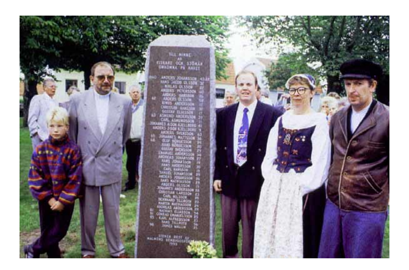
Figure 2. The consecration ceremony in Bohus-Malmön in 1993 carried out by a clergyman with the participation of many local inhabitants.

The dedication ceremonies have been conducted by clergymen with the participation of local historians, former fishermen and seamen (Fig. 2). The names of all the dead victims are read out and a wreath placed in front of the memorial. The clergymen's participation has given a spiritual dimension to the ceremony similar to that taking place at an ordinary funeral service, something that those who died at sea had never benefitted from. A great many local inhabitants, both old and young, men and women, have been present at these ceremonies as has been reported in regional newspapers. About two hundred people attended the ceremony at Lyse near Lysekil in 2002 ( Bohusläningen 2002). The memorial consequently becomes a communal concern of interest to the entire local populace. Many local people have relatives among these long-dead victims.