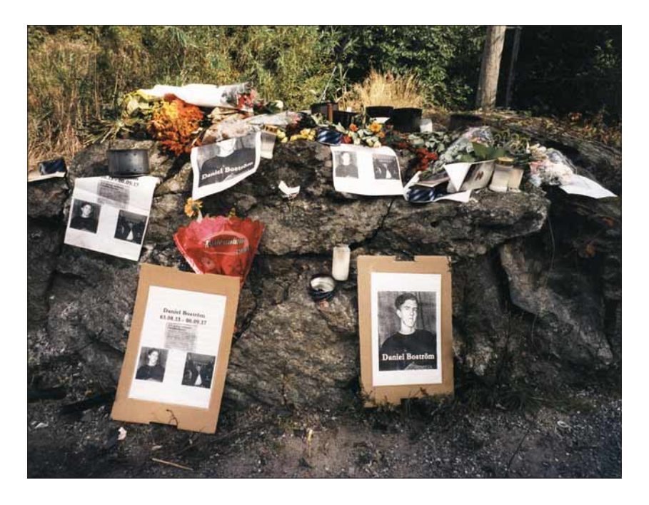
Figure 4. A 17-year-old boy from Västra Frölunda in Gothenburg lost his life after crashing his car in this mountainside in September 2000. The next evening his young friends gathered at the site and placed there several photographs of the victim, flowers and numerous lighted candles and torches.

I had the opportunity to conduct a documentation of a memorial event in Morlanda on the island of Orust in September 2000. A seventeen-year-old boy from Västra Frölunda, a suburb of Gothenburg, crashed his car one night on a