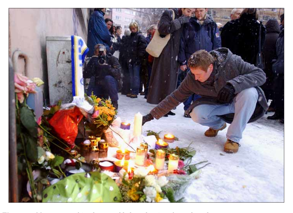
Figure 6. Many young friends assembled at the site of murder when a young man, 23 years old, was killed outside his home in Oslo in 2002.

Ritual expression is felt to be necessary not only at the scene of a murder but also in the public sphere where many people can gather together, as has been shown in connection with deaths due to traffic accidents (see above). In the public space, people can experience solidarity and give collective expression to their grief and protest against the traumatic situation that has arisen. On the evening after Sabina's murder in Arvika, more than 2,000 people came together in the town square to take part in a memorial ceremony for both Sweden's foreign minister and for little Sabina. Here no distinction was made as to social class or age. Death obliterates all social stratification. The mes-