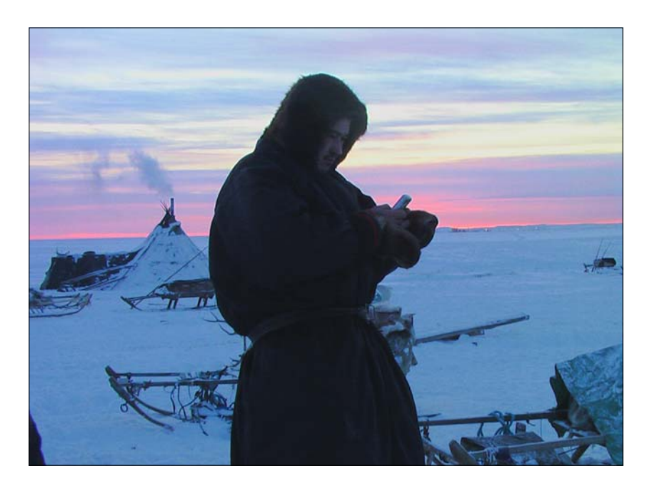
Figure 2. At attempt to send an MMS from Varandei tundra.

I witnessed another novel extended use of mobile phones in 2007 with monitoring of environmental impacts of industrial development in the tundra. They make use of the extended technological capacity of modern phones which reaches beyond voice communication. Reindeer herders on duty with the herd during day and night travel frequently across oil installations, drill sites, wells, abandoned infrastructure, crossing pipelines or travelling along these. During these travels they immediately notice every change and also instantly con-