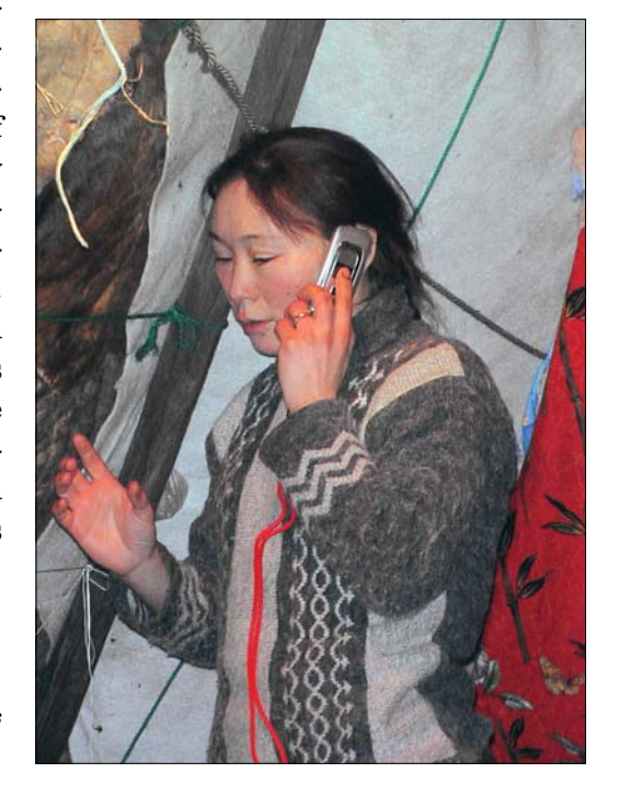
Figure 3. Domestic use of mobile phones by women.

associated with the spread of television programmes to remote corners of the globe (Hoffmann-Novotny 1993). Some authors ask if the spread of the mobile phone may be culturally and socially more significant than the spread of television (Katz & Aakhus 2002b: 4ff). For reindeer herders in the North I would argue that it is indeed, as for a life on the move the mobile phone is much easier to accommodate than television sets, which require elaborate antenna systems and more power supply.