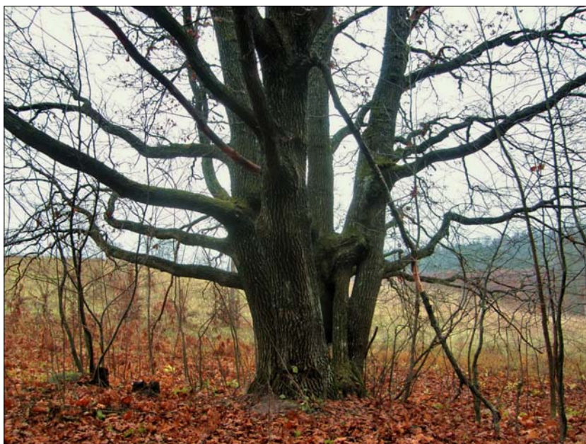
Figure 5. The sacred oak near Užukalnis (Prienai District), which is famous for its six holes shaped by multiple trunks and branches grown together. A special healing ritual which involved going naked through one of the holes at sunrise was carried out at the tree.