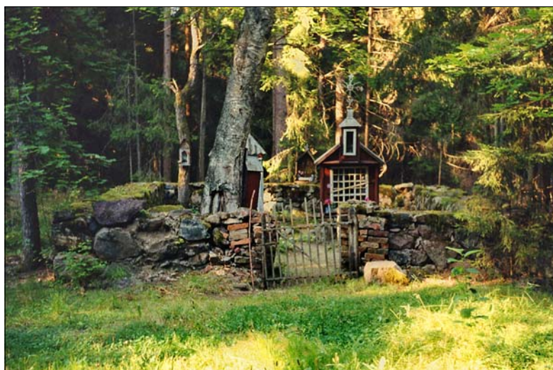
Figure 2. The natural holy place located in the forest near Kiršai (Telšiai District). Photo by Saulius Lovčikas (1995). Courtesy of the author.

The local holy places in groves and forests are located mostly in Samogitia, the ethnographical region in western Lithuania with a predominantly Catholic population. Typically there is a group of trees of the same or different kind: pines, firs, birches, etc. Often one of them is older than others. Between the trees, there are one or several miniature wooden chapels with figurines of St Mary, Jesus Christ, or Saints as well as just crosses. The latter used to be monumental (those erected on the ground) or small pieces nailed to the tree trunk. Such an ensemble is traditionally surrounded by a stone wall or a simple fence (Fig. 2). Sometimes the ensemble also incorporates a natural or artificial well inside or, more often, outside the boundaries. Collective religious