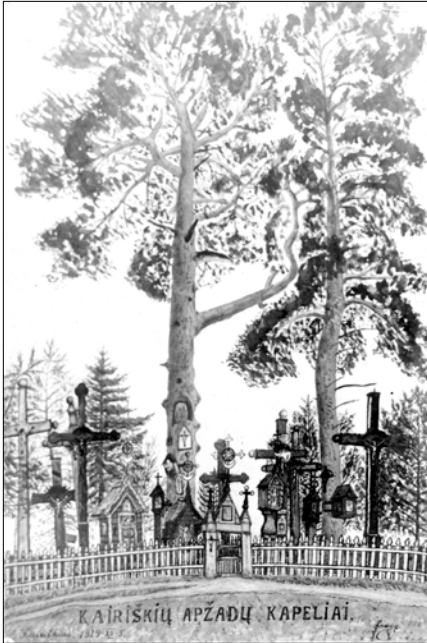
Figure 3. Apžadų kapeliai ('Vow's cemetery') located near Kairiškiiai (Akmen District). Drawn by Jaugas (1929).

activities were practised here once a year, usually in summertime. In the recent past, an ancient method of banging a wooden board hung on a tree in the holy place was used to call people together for a common prayer.