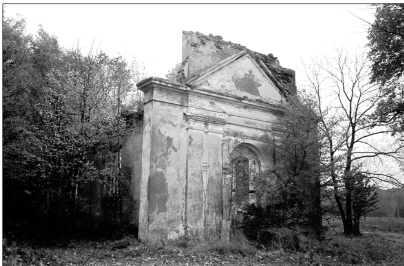
Figure 4. The so-called Fridays' site near Digriai (Kaunas District). Built in 1837 near the sacred ash chapel of Jesus' Heart, it was widely known as a place where Mass was held every Friday, as well as a pilgrimage destination. There was a double-stem ash grown into one at the back of the building until the priest ordered it to be cut down (soon after the chapel was consecrated).