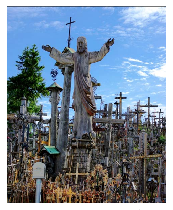
The Kryžių Kalnas ('Hill of the Crosses') near Šiauliai.