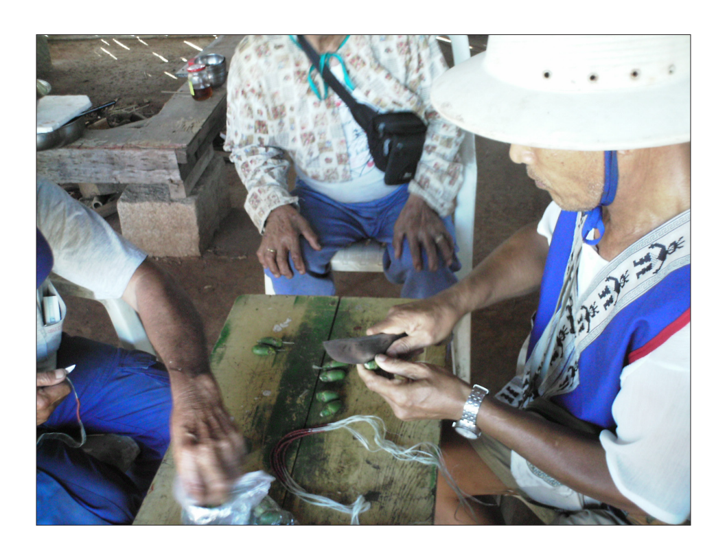
Figure 2. A wizard and his assistant are making a betel nut spell in the palakuan.