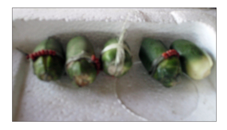
Figure 1 . Each betel nut represents an evil spirit. From right to left as follows: natural death, unnatural death, bad thing, gossip, and jealousy.