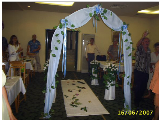
Figure 3. The white cloth placed on the floor in a restaurant in Plovdiv.

Yet another aspect of the meaning of the white cloth in a contemporary wedding that has to be mentioned is its fertility function. It has to assure fertility of the family, i.e., the cloth acquires magical and protective qualities, like many other traditional items, although it is difficult to determine to what extent the informants really believe in its magical qualities. The DJ 16 at the restaurant pronounces wishes for many offspring while the couple is still walking on the cloth.