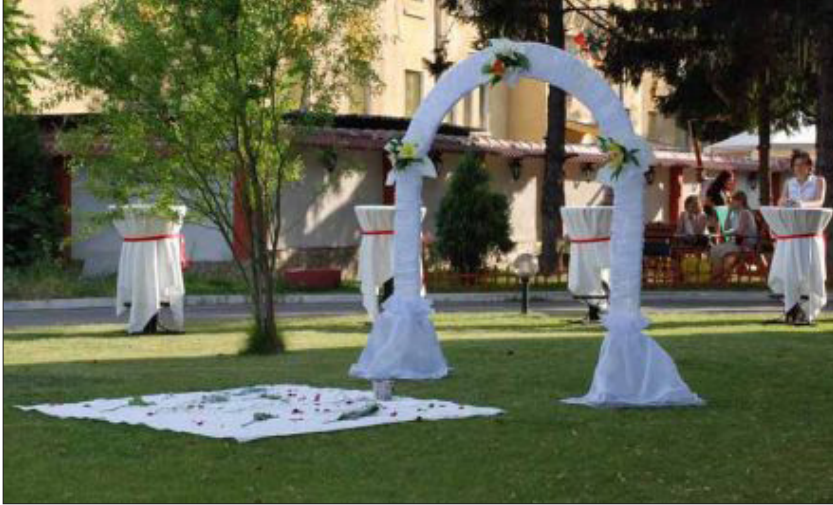
Figure 4. The white cloth laid out in the garden of a restaurant in Sofia. Photograph by Rozaliya Guigova 2008.