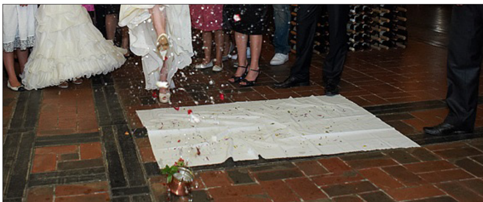
Figure 1. The bride kicks the jug while stepping on the white cloth in a restaurant in Sofia.

evil forces. In the same manner and maybe because of the same belief, the present-day Bulgarian bride unstitches the lining of her wedding dress in several places. Both of them are obliged to accomplish that action secretly, with no one's knowledge. Therefore, I think that some of the objects today may change their material shape, could be susceptible to fashion influences or technology of production, but they continue existing in rites, following the logic of cultural continuity between tradition and contemporary culture. Therefore, the white cloth that is placed today in a restaurant during a wedding ceremony could also be seen as the carrier of cultural continuity. In this context, I hereby also investigate the ritual function of the white cloth in urban culture, as far as culture is understood in a more general sense of the process, through which human groups construct themselves and socialise (Miller 1994: 399). Culture is always a process rather than a set of objects, such as the arts, and it should be seen as an evaluation of the relationship through which objects are constituted as a social factor (Miller 1987: 11).