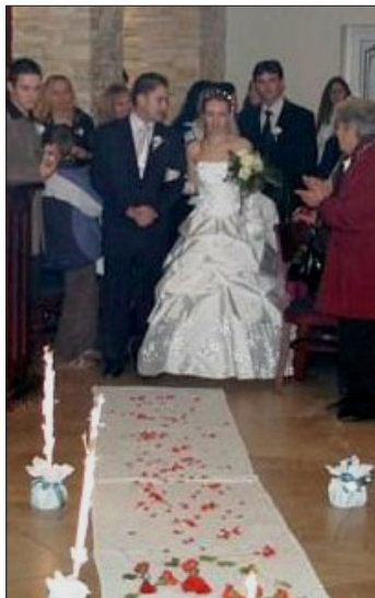
Figure 5. Newlyweds on the cloth. Sofia.

village to the city very literally, the process can sometimes be difficult and even amusing: