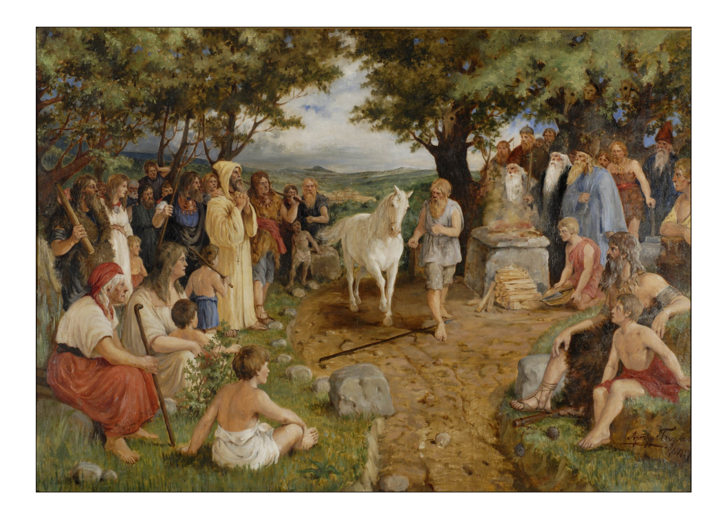
Figure 2. Arturs Baumanis. Likteṇa zirgs (The Horse of Destiny, 1887). Latvian National Museum of Art.

folklore filled the niche between two opposites (when talking of its value for nation-building) on the axis of national content in art: the anonymous landscape of the native land and the heroic events of the past.