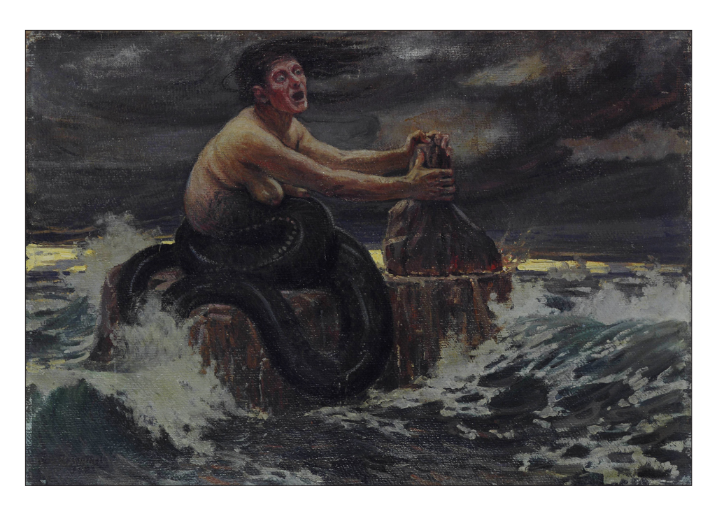
Figure 4. Janis Rozentāls. Melna čuska miltus mala (The Black Snake Ground Flour, 1903). Latvian National Museum of Art.

Pērle (1875–1917) around 1916. Living in St. Petersburg after graduating from Stieglitz's school, Pērle established a distinctive style of his own, in later years developing imagery close to that of Lithuanian artist Mikalojus Konstantinas Ciurlionis (1875–1911), whose already famous works he might have seen in several exhibitions in St. Petersburg (Lamberga 2014: 60). Pērle worked in various media, for example watercolour, oil, etching, and others, depicting various subjects from purely decorative floral compositions to complex symbolic narratives. The Black Snake is not the only one of Perle's works that refers to folksongs: Kara karodzina rakstītāja (Embroiderer of the War Flag, 1916) both illustrates a recognisable folklore motif and bears ethnographic ornament within the composition; the choice of words in the Latvian title of Saulīt vēlu vakarā (The Sun Late in the Evening, 1916) indicates a folksong; the same applies to the mythological motifs of Saules deli karā jāja (The Sons of the Sun Rode into Battle, 1917). It seems that the artist's interest in particularly national (and, in two out of four, militant) subjects might have been related to the recent outbreak of World War I, which ravaged his native land of Latvia.