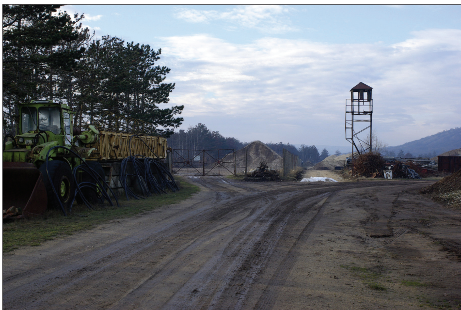
Figure 4. Russian barrack.