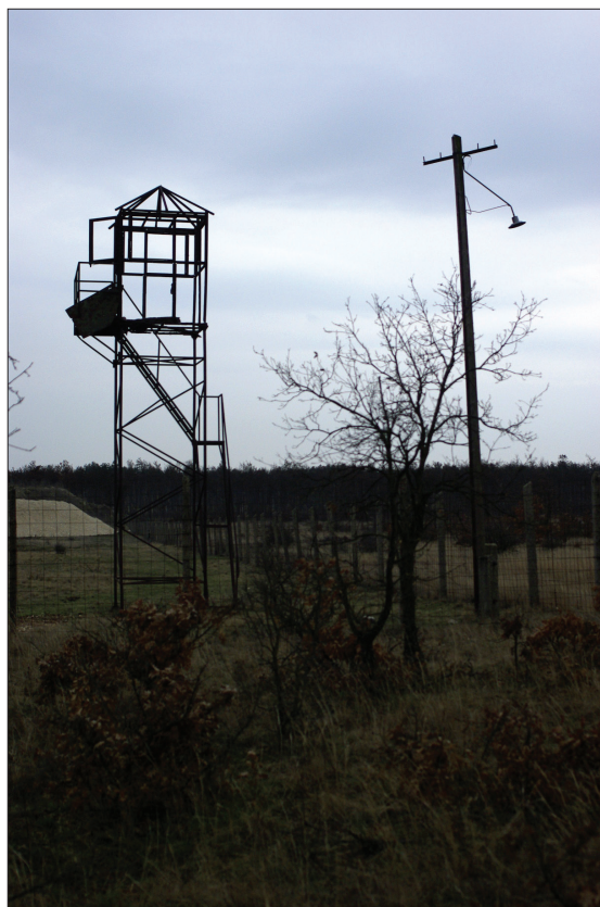
Figure 5. Watchtower in the territory of the Russian barrack.