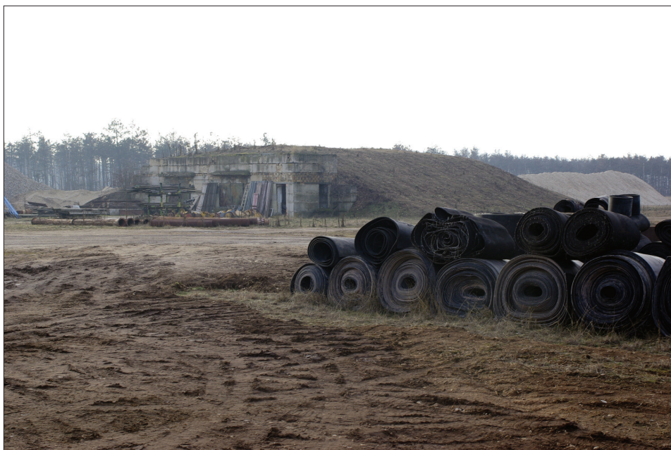
Figure 3. Bunker in the territory of the Russian barrack. Photograph by István Sántha, November 2015.