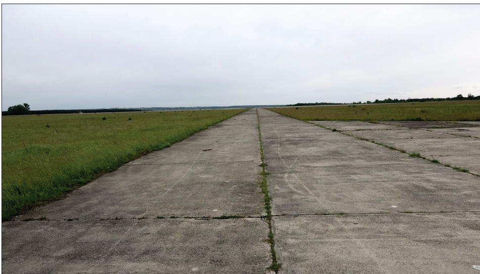
Figure 6. Airfield.