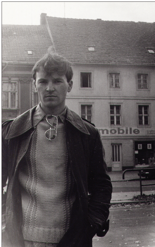
Figure 2. A Soviet officer in his free time in the GDR in the 1970s. Photograph from the private collection of a respondent.

taught young soldiers. 20 Because of hazing and for other reasons, there sometimes were cases of desertion and crime among Soviet soldiers. However, such incidents were quickly suppressed in active cooperation with the GDR police.