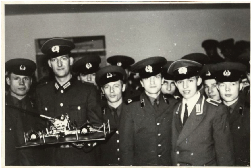
Figure 4. A meeting of soldiers from the USSR and the GDR in the 1970s.