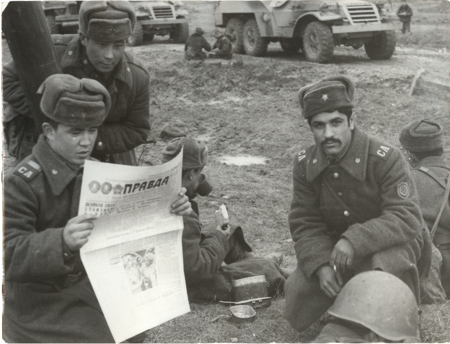
Figure 1. The multi-ethnic Soviet Army in the 1970s.

the largest groups were Russians and Ukrainians, followed by Armenians, Georgians, Azerbaijanis, Chechens, Tajiks, Uzbeks, and Latvians. 17