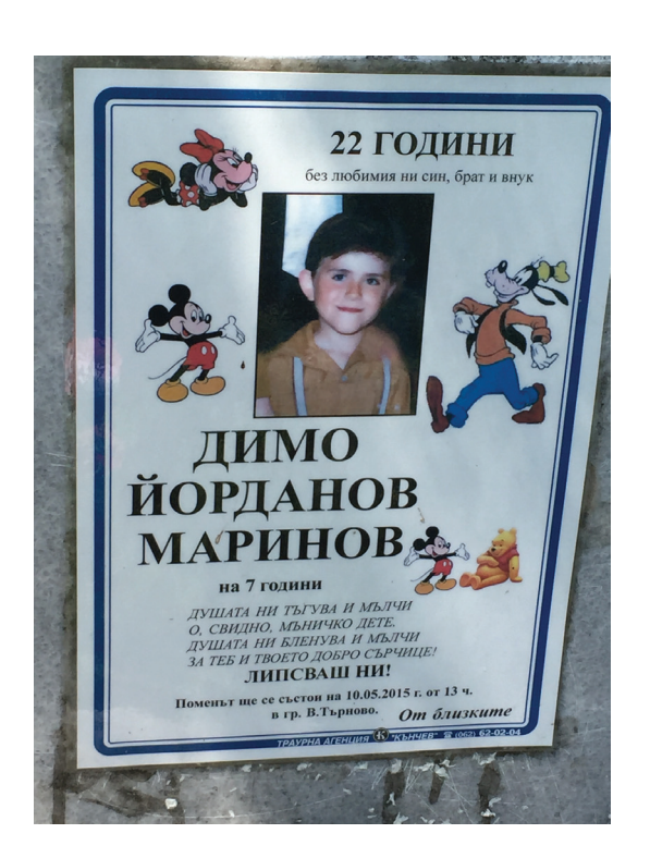
Figure 2. A Bulgarian obituary for a boy of 7 years. Veliko Tarnovo cemetery.

Heroes of fairy-tales and decorative elements dominate in obituaries that are widespread in Bulgaria and Northern Macedonia (Fig. 2).