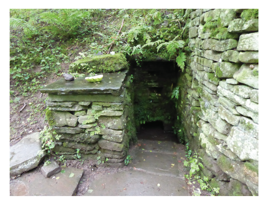
Figure 3. The holy well of St Issui, Patrishow, Powys, Wales, surrounded by niches for offerings. Photograph by the author, 22 July 2017.

The Patrishow coin tree stands close to the holy well of St Issui. The life of this saint is little known, but he is often described as a holy man living a secluded life in a hermit cell beside Nant Mair, or Mary's Brook. Close by was his well, containing niches in which offerings could be left (Figs. 3–4). Legend tells of a French pilgrim whose leprosy was cured by this well; in gratitude, he left a sack of gold, which was used to build the earliest part of the nearby eleventh-century church (Baring-Gould & Fisher 1911: 321–323; Jones, F. 1954: 145; Pemberton 1999: 190; Jones, A. 2002: 68–69).