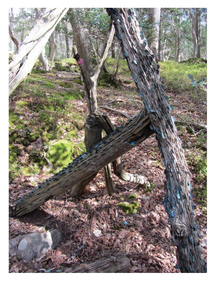
Figure 1. The coin tree on Isle Maree, Northwest Highlands of Scotland. Photograph by the author, 14 April 2012.

Maree – in the eighth century and widely believed to cure insanity. Beside the holy well was a tree, which was utilised as an 'altar'; pilgrims who sought a cure from the well would leave their tokens of thanks to Saint Maelrubha on this particular tree (Pennant 1775: 330).