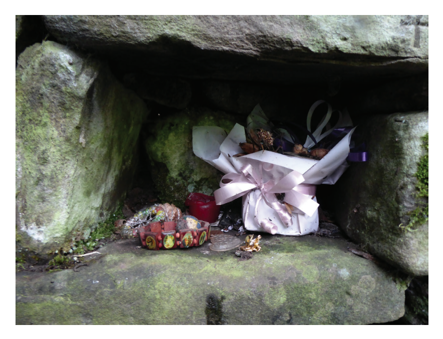
Figure 4. One of the niches containing offerings at the holy well at Patrishow. Photograph by the author, 22 July 2017.

The well that occupies the site now is probably an eighteenth- or nineteenthcentury rebuild (Jones, A. 2002: 68; De Waal 2011: 73). Fed by a shallow spring, the well is surrounded on three sides by stone walls and covered by a stone slab. In 1804, Welsh topographer Richard Fenton described it as "a very scanty oozing of water, to which, however, was formerly attributed great Virtue, as within the building that encloses it are little Niches to hold the Vessels they drank out of and the offerings they left behind" (Fenton 1917: 26). By the nineteenth century, therefore, this site was still a place of ritual deposition, and indeed it continued to be one throughout the twentieth and into the twenty-first. A photograph in Siân Victory's The Celtic Church in Wales shows how the well still contained niches for offerings in the 1970s (1977: Plate IV (a)). And on my visit to the site in 2017, there was a vast variety of objects deposited around the well, from candles and makeshift crosses to jewellery, semi-precious stones, and children's toys.