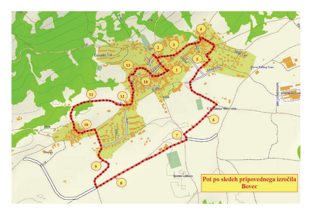
Figure 4. Map of the thematic trail following the narrative tradition of Bovec from the brochure Podeželski elektronski vodič (Rural Electronic Guide) (2013).