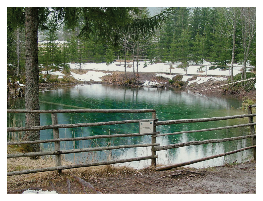
Figure 1a, 1b. Meerauge trail in Bodental above the Loibl Pass in Austria.