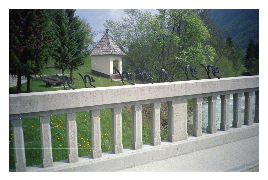
Figure 2. The fairy-tale trail of the Alpine area in Dovje near Mojstrana in Slovenia.

Children are guided through the mythical world of Velika Planina by the Wild Man ( dovji mož ). In Kranjska Gora, children and families can experience folk-tales about Pehta , Bedanc , and Kosobrin in Kekec Land (Source 7).