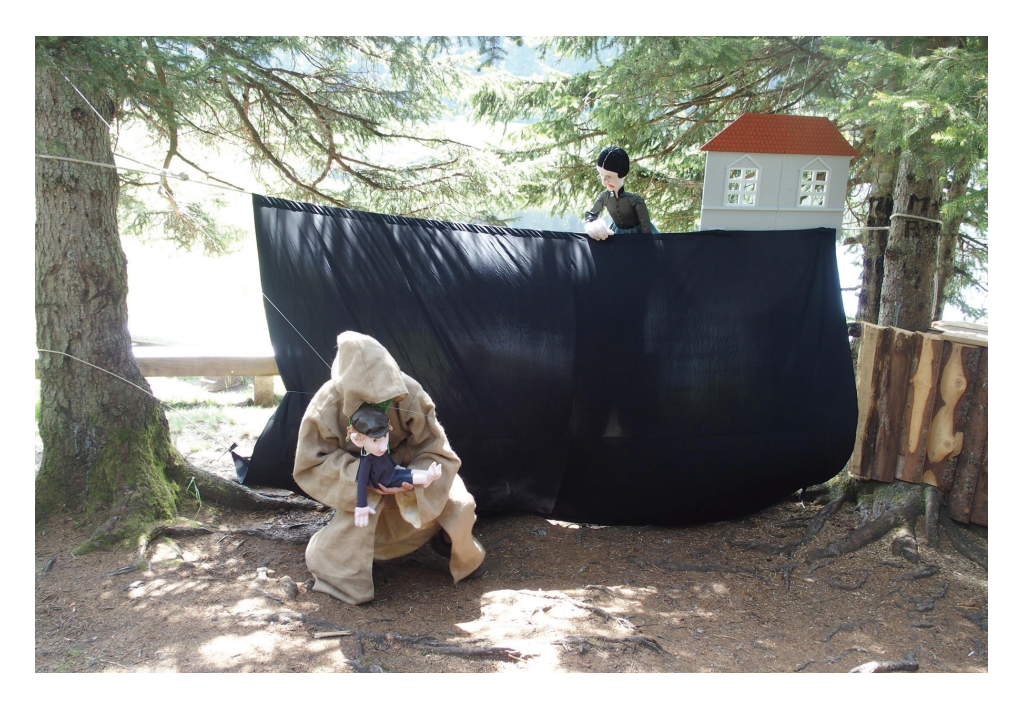
Figure 3. Folktale trail in Pohorje: Črno jezero (black lake) with a puppet show performed by the Koruzno zrno Society. Photograph by Stanka Drnovšek, 11 June 2019.

The folktale trails in Pohorje mostly include legends about people experiencing their natural environment and encountering the supernatural world. The legends tend to be somewhat frightening because apparitions often incite fear. The Pohorje trail starts in Slovenska Bistrica with its most prominent attraction, the Slovenska Bistrica Castle. Its previous owners were the counts of Attems, while today it is state-owned. The starting point in Istria is the settlement Gologorica in the municipality of Cerovo with its Roman Catholic Church of the Blessed Virgin Mary.