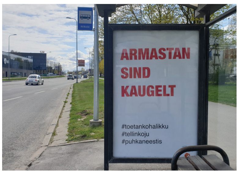
Figures 2a & 2b. Application of expression folklore in local crisis communication in Tartu.