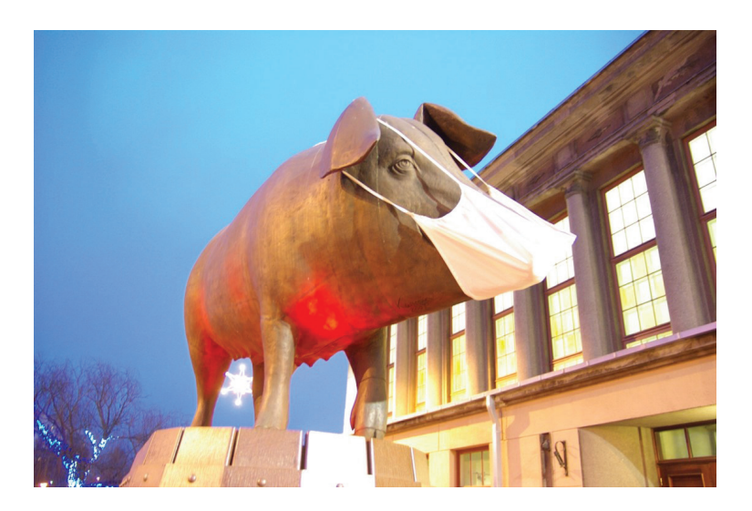
Figure 7. The swine flu proverb spread on the internet with a picture depicting the sculpture Bronze Swine by Mati Karmin in front of Tartu Market Hall. Fearing the swine flu epidemic, the townspeople protected the bronze swine by covering its face with a mask. Photograph by Ilmar Oja 2009.

It is worth recalling that the fear of infectious diseases has previously been treated with paroemia as well. There has been a conundrum since autumn 2009 when a new disease, named swine flu among the population, spread panic throughout the world, including in Estonia; it is once again proof of how the former models of one genre live on as parodies of another genre's functions: "How do you tell the difference between flu and swine flu? Those who have good flu, sneeze, and those who have swine flu, squeal."