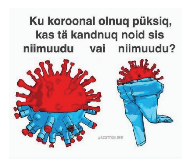
Figure 11. Memes aim to depict the virus graphically. The sphere-shaped virus is depicted via the meme model 'If X wore pants would he wear them like this or like this?' A post sent to Mare Kalda on 31 March 2020 in private conversation.

Corona memes are directed at avoiding the disease or being rescued from it; the memes lack the perspective of having direct contact with the disease. Memes rarely depict sick people and hospital wards. If they do, then an image in the form of a caricature is created (instead of the usual photo editing). The depictions of the virus stem from the virus itself. This stereotypical presentation depicting a colourful ball with spikes helps make the virus symbolically comprehensible and treatable and therefore less frightening. Such a procedure is also reflected in a meme adapted to the Estonian situation 'If X wore pants would he wear them like this [image] or like this [image]'. The virus has been made to play along with this game: the meme depicts the virus as a living being wearing trousers (Fig. 11).