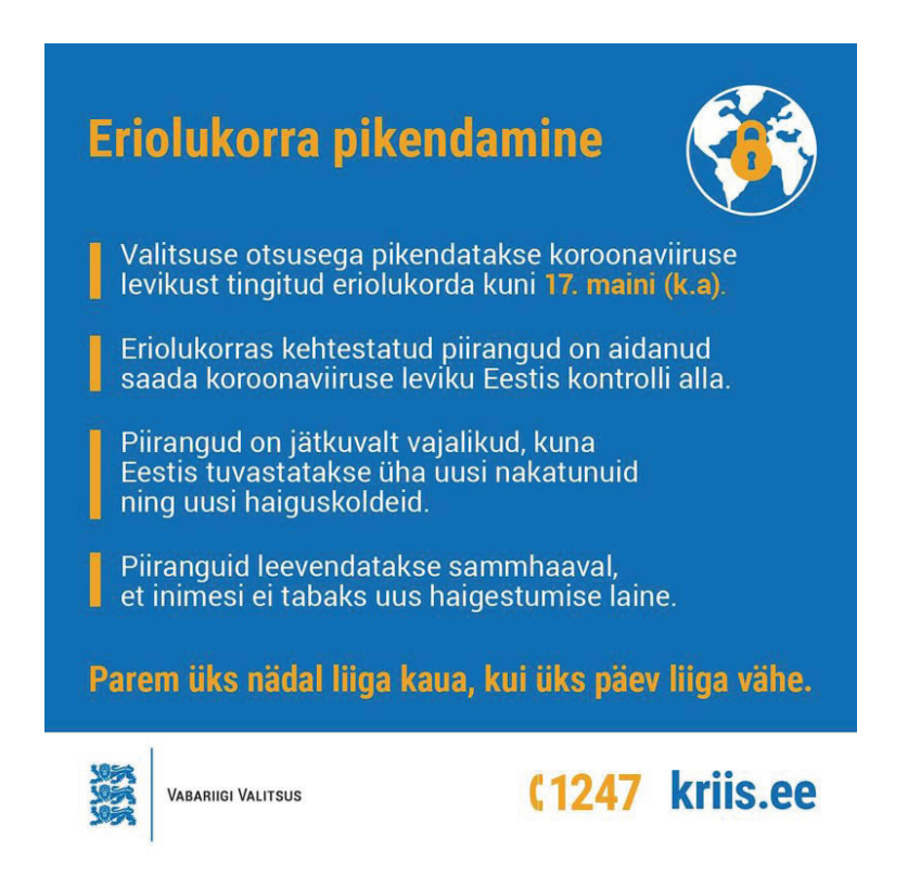
Figure 3. Government announcement on the extension of the emergency situation on 24 April 2020.

Based on earlier proverb material, new constructions were developed alongside old and distinguished ones. This was effective in the imitation of the proverb format model. One of the most fascinating examples in the Estonian corona crisis was an idea in the form of a proverb, "Better one week too many than one day too few", which was phrased by the then Prime Minister of Estonia, Jüri Ratas, at a routine emergency situation press conference on 23 April 2020, when explaining to people the need to prolong the emergency situation by a minimum of two weeks. The government's announcement poster sent out a day later via various distribution channels featured the same proverbial saying (Fig. 3), which uses the common syntax format element characteristic of proverbs "better... than..." According to Arvo Krikmann, such a formulaic model does not merely function in the form of formal logical components but participates in giving substantive meaning to the whole text (Krikmann 1997: 267). This example proves how the concept of the proverb as a historically anonymous expression has changed; thanks to quick communication, it is possible to identify the 'first' user in many cases (Granbom-Herranen 2016: 321). Hence, the crisis clearly highlighted the role of the individual in lore creation.