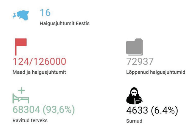
Figure 1. Screenshot from Õhtuleht, 19 February 2020. Source: https://www.ohtuleht.ee/992731/uus-koroonaviirus-ei-taltu-surnute-arv-tousis-ule-2100-uus-suur-haiguspuhang-avastati-louna-koreas, last accessed on 12 February 2021.

The personified and localised depiction of threat seems to be universal in disease narratives. In Estonian as well as wider European plague lore, the plague comes from a certain direction and passes certain places. The urban legends related to AIDS consider certain restaurants and petrol stations to be dangerous places in which an unsuspecting visitor may allegedly become infected. The threat of illness is also marked by the selective use of place names. In Estonian and international news media, it seemed almost ritualistic to begin every coronavirus-related news story by stating the fact that the virus was born in the city of Wuhan, China – this model was followed long after the virus had gained a global grasp. Narrative speculations about the place of origin or main spreading centres of a disease probably emerged in the case of all major epidemics (cf. Spanish flu, also the Ebola virus that was officially named after the Ebola River). In the Estonian vernacular discussion, a limited number of places marked with the respective name also became selective sources of infection associated with corona – for example, the island of Saaremaa was named Koroonasaar (Corona Island), and its biggest town Kuressaare was named Koroonassaare or the corona capital due to its becoming a centre of infection, and in August Tartu was named the virus capital after a relatively small-scale new virus outbreak, painting a polarised and simplified image of the spread of the disease.