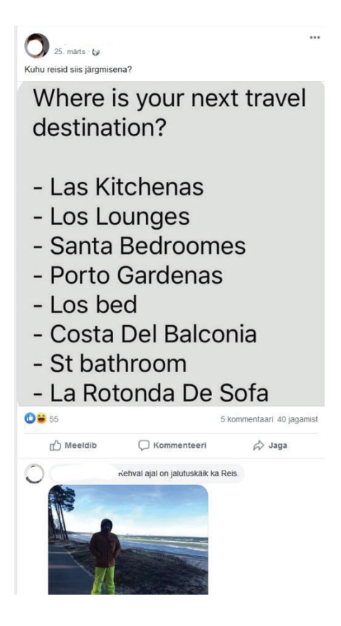
Figure 9. Reaction to travel restrictions. The viral circulated from 25 March 2020.

With viral content and global memes, Estonian social media content is characterised by memes reconstructed for Estonian context, which are complemented by local memes – local both in terms of content and format. While in other connections meme themes combining global and local subject matter have been interpreted on the one hand as an attempt to solve problems that occur in a faraway land and on the other hand as the dissemination of local phenomena to a wider circle of users (Laineste & Voolaid 2016: 28), the pandemic is not a problem of a faraway land from any perspective – it is a common threat, a situation that caused similar worries and was responded to in much the same way all over the world. In the units contextualised into local culture, the characters and objects of interest – as is common in memes – are characters and situations of popular culture related to quarantine, the purchasing of convenience goods and food, personal characteristics, emotions, and many other similar aspects. The text fragments in Estonian are either translated or are completely new - designed for specific use. Of the fictitious and actual characters from popular culture, we meet Dobby the house elf, Beavis and Butthead, Drake, two monkey puppets, etc. (this list could go on forever).