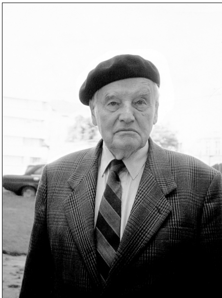
Photo 1. The best-known Estonian ethnologist Ants Viires.

The war had passed, but the past kept reminding itself under the new ideological regime. The circle of the Estonian ethnologists who did not leave was severely diminished. The Estonian National Museum, the then centre of Estonian ethnology, was marked as the nest of bourgeois nationalists. Some ethnologists were fired; others were transferred to lower positions, yet others, among who was also Ants Viires (then MA), could not find work suitable for their qualifications. Moreover, Viires' record was not spotless enough for