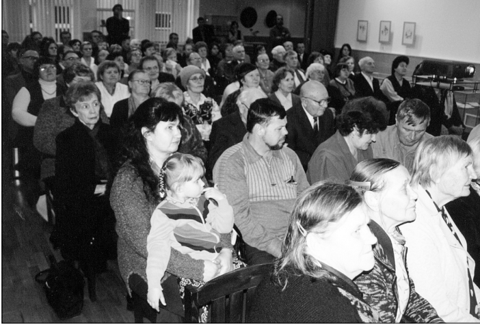
Photo 1. The lecture day had much attendance. Photo by Alar Madisson, 2003.

ans born in Russia, questioning them on migration stories, life in the village of birth, customs and traditions as well as about their return to Estonia: e.g. adaptation to the new situation, participation in family, village, etc. reunions. My most valuable finding, perhaps, was Artur Kergandi's work "The Formation and Destruction of Estono-Semenovka village", which was a well-written study based on the recollections of local villagers. A copy of the study is now stored in the Estonian Folklore Archives.