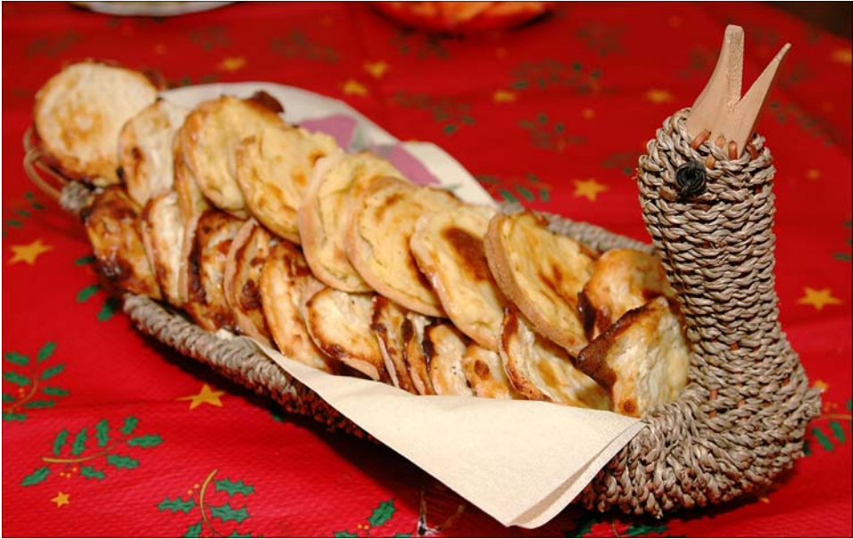
Photo 1. Traditional Komi foods added Finno-Ugric flavour to the day. April 2006.