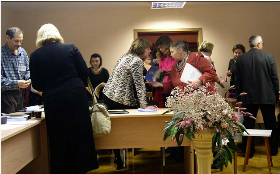
Photo 1. Visitors of the congress at the registration. February 2006.

Most of the speakers in this session had arrived at their topic by relying on their personal fieldwork experience or having read theoretical studies on fieldwork.