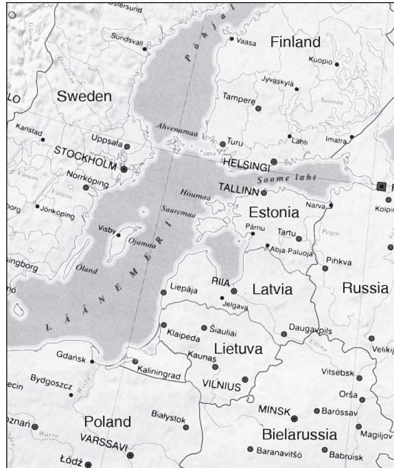
Figure 1. Map of Estonia and neighbouring countries.

Estonian National Museum 1919–1920. The hand-written memories of one of the key figures of the quondam events, August Pulst 3 , are located in the archive of the Art Museum of Estonia, as well as in that of the Estonian National Museum (ENM). Content-wise, this is actually a manuscript of the memories, the initial variant of which is a hand-written draft version, written during the period 1943–1948 and titled The Estonian Museum in Tallinn. Historical data , with abundant corrections and additions (Pulst 1948). The typescript text from 1973, My work in connection with folk art – ethnography , preserved in the ENM, is a more succinct summary written on the basis of the former version (Pulst 1973). Likewise, I have also used the unpublished article by Heini Paas from 2004, entitled About the history of the Estonian Art Museums 1919–1944 . Earlier, the same author has published an article About the history of the Estonian State Art Museum, the establishment and history of the museum 1919–1940 ” (Paas 1980). However, the earliest and most immediate insight in the subject matter is the article by Bernhard Linde, The development of the idea of the Art Museum of Estonia, and the Estonian Museum Society in Tallinn (Linde 1931).