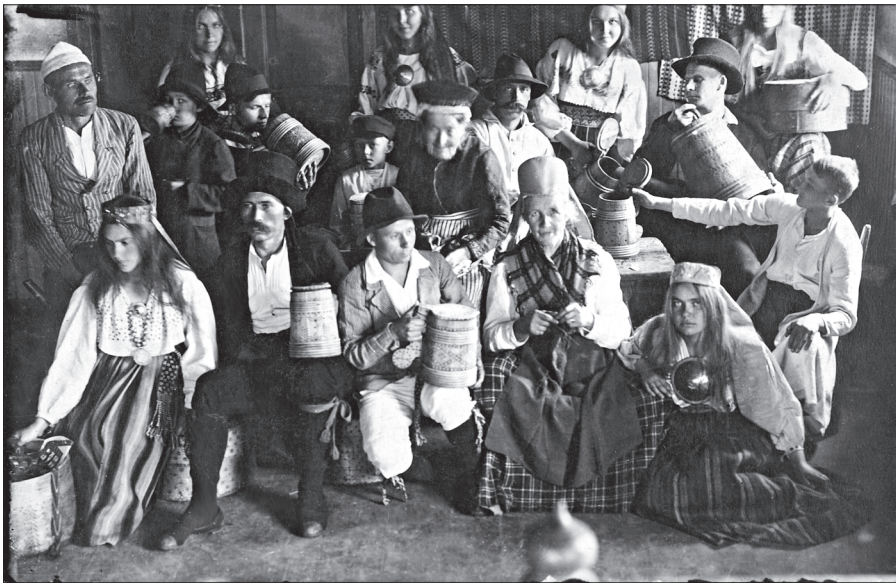
Figure 3. Participants in the Raiküla party, arranged by the Estonian Museum in Tallinn. 1920. ERM Fk 1706:18.

1925 was pivotal for the museum with regard to the change of course – earlier diffusion and the creation of new departments, i.e. fragmentation was replaced with consolidation and focusing, by putting two domains in the forefront: the department of fine arts and the collections of cultural history related heritage, as the ones deserving most attention, were arranged for display (Linde 1931: 13).