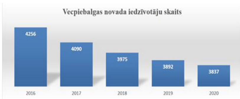
Figure 2. Population changes in Vecpiebalga from 2016-2020.

has suffered the worst depopulation, due to more severe emigration and other factors, including a lack of apothecaries (Figure 2; Vecpiebalga.lv 2020).