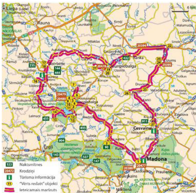
Figure 1. Map of Piebalga cultural region. From Jaņu seta 2015.

The Piebalga region consists of two small municipalities – Jaunpiebalga (New Piebalga) and Vecpiebalga (Old Piebalga), as well as many other, smaller ones such as Dzērbene, Taurene, Ineši and Rauna (Figure 1; Vecpiebalga.lv 2020; Jaunpiebalga.lv 2021). The municipalities were independent until administrative reforms during 2021, after which they were added to the Cēsu region, and most of their management was taken over by the Cēsis municipality. Piebalga had already been part of the Cēsis municipality until the administrative reforms of 2009 split many of the larger municipalities into smaller ones. Now the Piebalga region is part of Cēsis municipality again (Vecpiebalga.lv 2020; Jaunpiebalga.lv 2021).