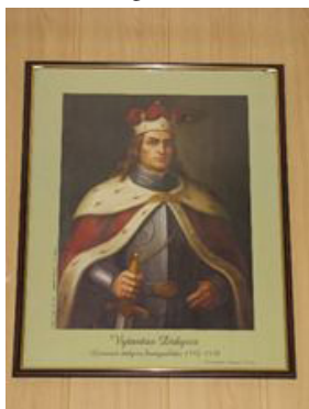
Portrait of Vytautas the Great in the Tatar club in the village of Raižiai (Lithuania - 03.2012)

For the local topography, the events of the past and the participation of Vytautas the Great in them acquire a paradigmatic and meaningful character. According to a legend about the founding of the village of Studzianka (Poland), Grand Duke Witold passed through this area and especially liked a place with clean and cold spring water, where they had sunk a small well (Pol. studnia, pl.). Because of this, the Tatars who settled here began to call the settlement Studzianka (Borawski and Dubiński 1986: 231-2). The legend of the origin of the village of Forty Tatars (Lithuania) is also associated with the activities of the great ruler and the settlement of Tatar warriors in the area (ibid.: 2323). A legend about the name of Tatar village of Lukishki (Lith., Lukiškės) in the suburbs of Vilnius, which is considered to be one of the oldest Tatar settlements ('neighbourhood'), is associated with a Tatar who served in the army of Grand Duke Witold and ruled these lands, which were probably granted for devotional service. It is known from documentary data that from 1559 to 1567 Lukishki belonged to two Tatar brothers, the name of the village coming from that of their grandfather Luka, who lived around 1500 (Jakubauskas 2009: 16).