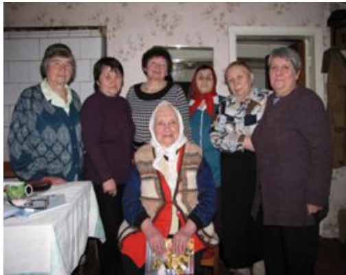
Tatars from the village Keturiasdešimt totorių (Lithuania – 19.03.2012)