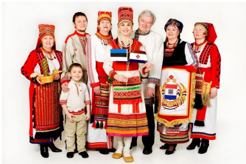
The Estonian Mordvin Society, 2012