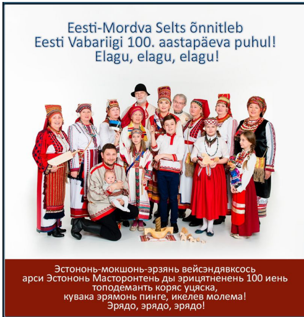
Estonian Mordvin Society, 2018.