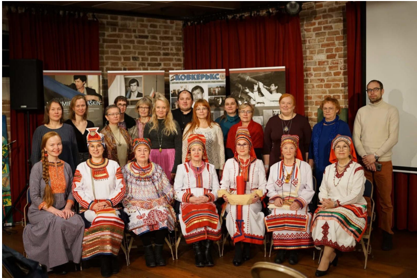
The J. Olo Conference. Viljandi Traditional Music Barn. The Sjatko Estonian Erzya Community, 2021.