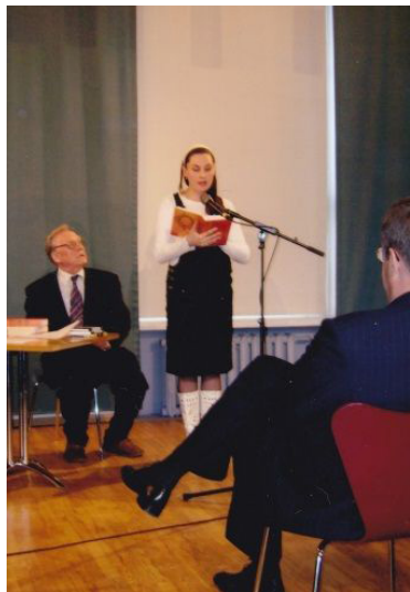
Presentation of the book Kuum õõ, Estonian president Toomas Hendrik Ilves present, 2007.