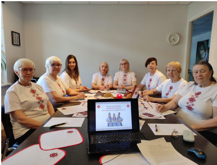
The Estonian Sjatko Erzya Community. Day of the Erzya language. 2021