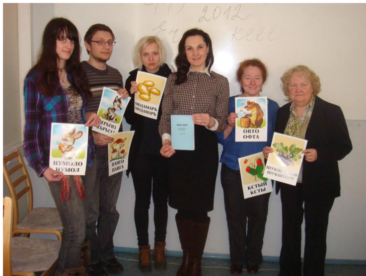
The Erzya language courses at Tallinn University, 2012