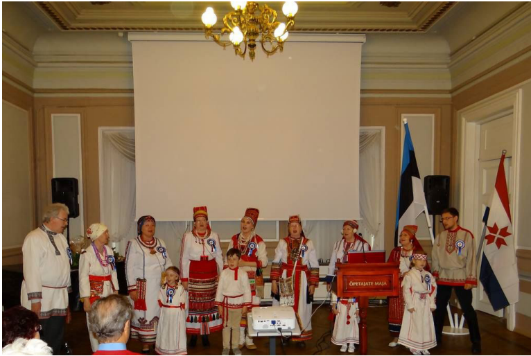
Twentieth anniversary of the Estonian Mordvin Society, 2015.