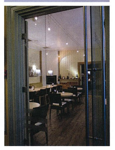
Figure 2. Stiftelsen Fengselet, Hønefoss. The photos show clockwise an overview of the former prison complex including the yards, which are now surrounded by the town park, a specially designed notice board, a restaurant, and a restored prison cell.

moved out in 1987, the building was used as a youth club for a while, but when all the activities terminated in 1999, it fell in disuse (phase 3). The building was mentioned in the county cultural heritage preservation plan in 1988. It was included in the town regulation plan from 1993 and gained status as a listed building according to the Norwegian Plan and Building Act. The planners in the municipality were worried about the increasing decay of the building and