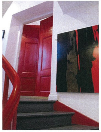
Figure 3. Galleri Fenka, Levanger. The photos show clockwise the exterior of Galleri Fenka in Levanger, the former court room on the first floor, the stairway on the first floor and the former cell for drunkards in the basement.