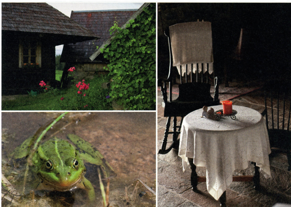
Figure 4. Visualising authenticity. Gifts of Taste , p. 240.

If, when you take the bread out of the oven, it turns out that the bottoms are a bit doughy and light in colour, simply put them back in the oven without the pans for 15 minutes. If you wish, you can brush the freshly baked bread with fresh farmer’s butter. I recommend that you let the bread cool for at least an hour before cutting. Warm bread is doughy! Of course, it is difficult to resist the fragrance of warm, freshly baked bread, but it’s worth it. (ibid.: 247)