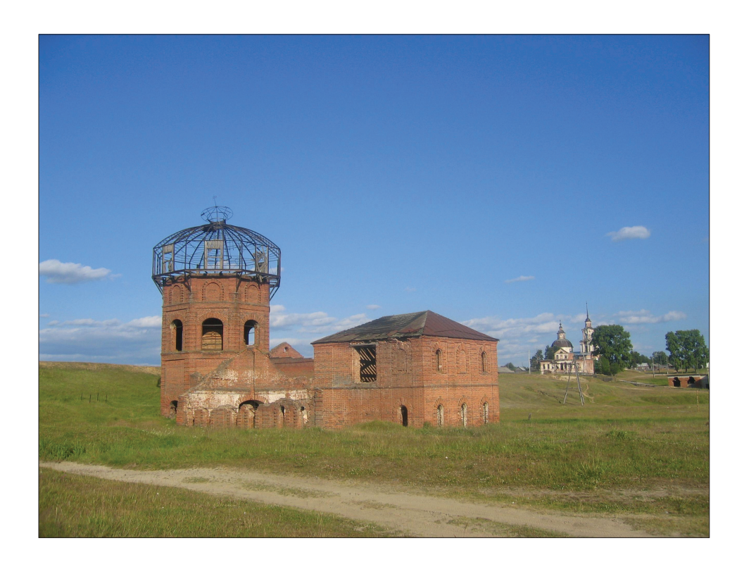
Figure 2. Building of an iron foundry; in the background the Church of St. Dimitry of Rostov. Settlement of Kazhym, Koygorodsky District.

In terms of their meaning, some folklore records refer us to published material about the history of the local industries, which apparently was used during school, museum, and production events and appeared in newspaper articles.