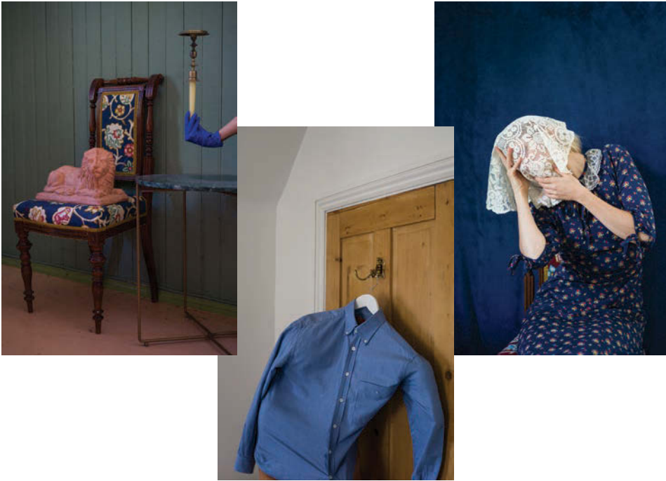
Figures 3–5. Mari Armei. “Blue Devils” (photo series). A reflection on melancholia.

The representation of illness and suffering in different media and arts has often been a means to reflect on the issues of human finitude and death. Mari Armei 's paper adopted the perspective of phenomenology to investigate the transformative effect of terminal illness on one's being-in-the-world in Leo Tolstoy's novella The Death of Ivan Ilyich (1886) and Akira Kurosawa's movie Ikiru (“To Live”, 1952). The radical changes in the bodies of the protagonists alter their relations with the world, turning it into an uncanny place. This starts a process of re-signification which in both cases transforms terminal illness into the access point to a more profound existential truth. A Heideggerian hermeneutical perspective on suffering and death was elaborated in the paper by Milani Perera , who compared Edgar Allan Poe's short story The Masque of the Red Death (1842) with Ingmar Bergman's movie The Seventh Seal (1957). While Tolstoy and Kurosawa represented individual illness, Poe's and Bergman's stories are set against the background of a lethal epidemic. Here being on the threshold of death does not bring about existential transformation. The social and political failure to properly deal with illness, suffering, and death results in an existential crisis (Bergman) or self-destructive denial (Poe). Michaela Dlouhá 's paper followed continuities and changes in the theme of illness, suffering, and death