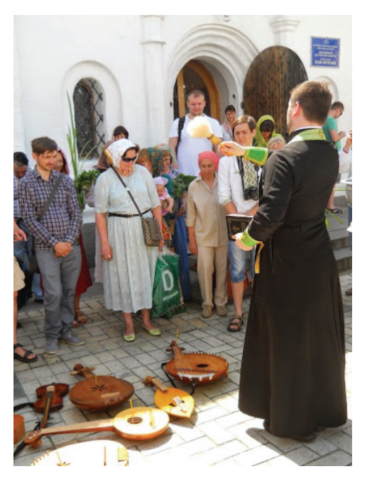
Figure 6. Blessing of kobzar instruments during the Epic Tradition Festival "Kobzarska Triytsia-2014". Kyiv, courtyard of the St. Michael's Golden-Domed Cathedral (Sakhno 2015).