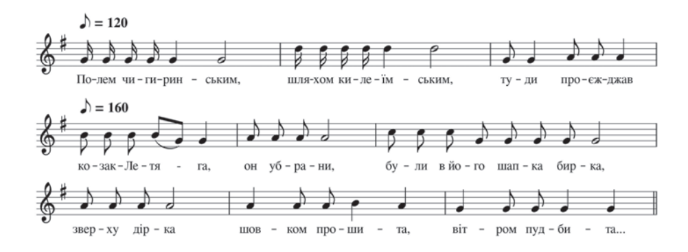
Figure 2. A fragment of a duma "Pro Ganzhu Andyber" ("About Hanzhu Andyber"), recorded by Klyment Kvitka in Polissya in the early 20th century (Hrytsa 2002: 111).

Thus, duma melodies of the central and northern regions of Ukraine are diatonic, with a narrow ambitus and an isosyllabic rhythmic pulsation. These melodies are closely connected to the poetic text, imitate the rhythm and accents of spoken language, and are distinguished by the repetition of certain notes, giving them a monotonous character. Syllabic singing, with one note per syllable, is quite typical of diatonic melodies. An example is the duma "Pro Ganzhu Andyber" ("About Hanzhu Andyber", see Fig. 2). Hrytsa calls duma melodies of diatonic type "psalmodic" and shows their similarity to the psalmody<sup>16</sup>, ritual songs and bylynas (Hrytsa 2002: 111).