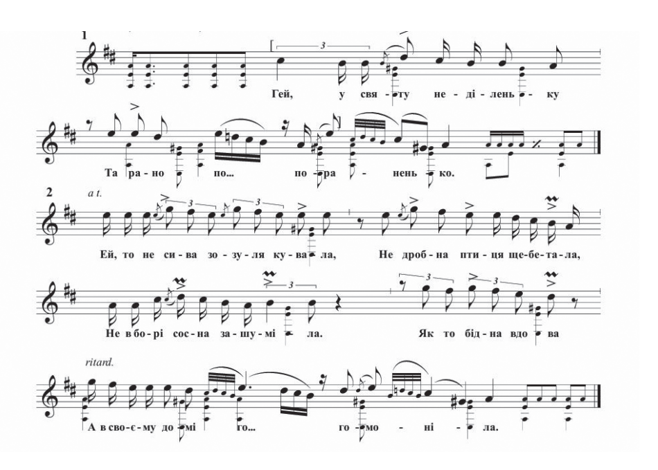
Figure 3. Duma "Pro bidnu vdovu" ("About the Poor Widow", beginning), recorded from Mykhailo Kravchenko in the Poltava region by Filaret Kolessa in 1908 (Hrytsa 2007: 223). 1 – zaplachka (lament); 2 – ustup; an incomplete vertical dash at the bottom of the staff marks the boundary of a tirade; the double vertical dash indicates a clausula. The chords performed as tremolo in the bandura part are written in a smaller size.

Figure 3 shows an example of a duma of the chromatic type "Pro bidnu vdovu" ("About the Poor Widow") from the Poltava region, north-eastern part of Ukraine. It consists of three parts: zaplachka (on Fig. 3 no. 1), main part (on Fig. 3 no. 2 is the first ustup of the main part), slavoslovie . The zaplachka contains two melodic formulas on which the following tirades <sup>17</sup> are based. The melody is decorated with small ornaments, such as grace notes, mordents, and accents. In the example, the most common melodic pattern can be followed, in which the melody descends in a wave-like manner from high pitches, occasionally rising by a small interval. The chromatic type of dumy is associated with short additional words, such as "Hey!" (on Fig. 3), "Oh", "O" etc.