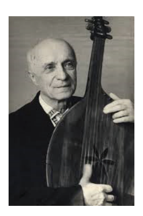
Figure 5. Heorhiy Tkachenko (1898–1993).

Modern Ukrainian performers reproduce the traditional performance of dumy both in a traditional environment (street singing, markets, churches) and on the concert stage. There are two distinct ways of preserving the tradition that are evident in contemporary times. The first is through the kobzar tsekh that strive to uphold the authentic tradition. Kompanichenko defines the modern kobzar tsekh as "[...] an association of people who aim to preserve the Ukrainian epic tradition not only as memories but as a complex of living values: freedom, love, sacrifice, truth, brotherhood" (Sanin 2024). Sighted and blind male musicians are members of these brotherhoods, passing on the epic tradition orally, with most of them being amateurs. Blind people are actively involved in modern kobza workshops, thus reviving the traditional practice. The modern kobzar tsekh has a close connection with the Orthodox Church, as evidenced by their organization of festivals on major Church holidays, mainly on Church premises with the ceremony of blessing instruments (see Figure 6).